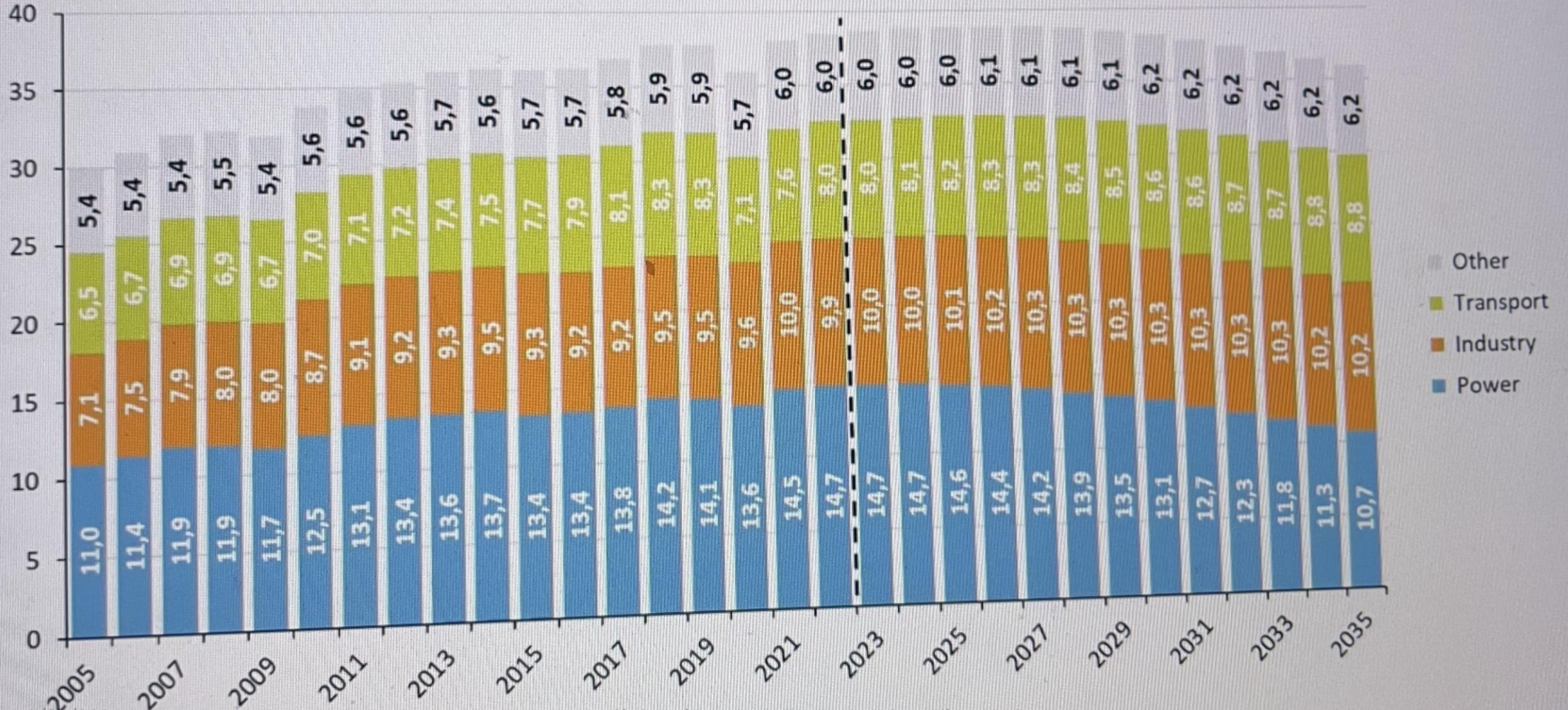
Fossil CO2 by year and sector – current pathway Gigatonnes